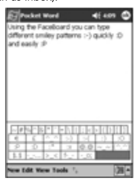
Fig. 5: Alternative Faceboard

This alternative FaceBoard will work better with some applications (such as Inbox).